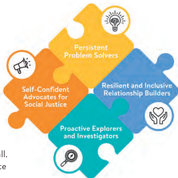
Portrait of a Pre-K Graduate

The Center’s school readiness goals are aligned with the Head Start Early Learning Outcomes Framework (HSELOF). Progress on school readiness goals as measured by Teaching Strategies Gold, KIDS, DRDP, HOVRS, and CLASS data are captured in quarterly data reports, which are reported in bimonthly board reports and discussed at length in Program and Impact committee meetings and Parent Policy Committee and Council meetings.